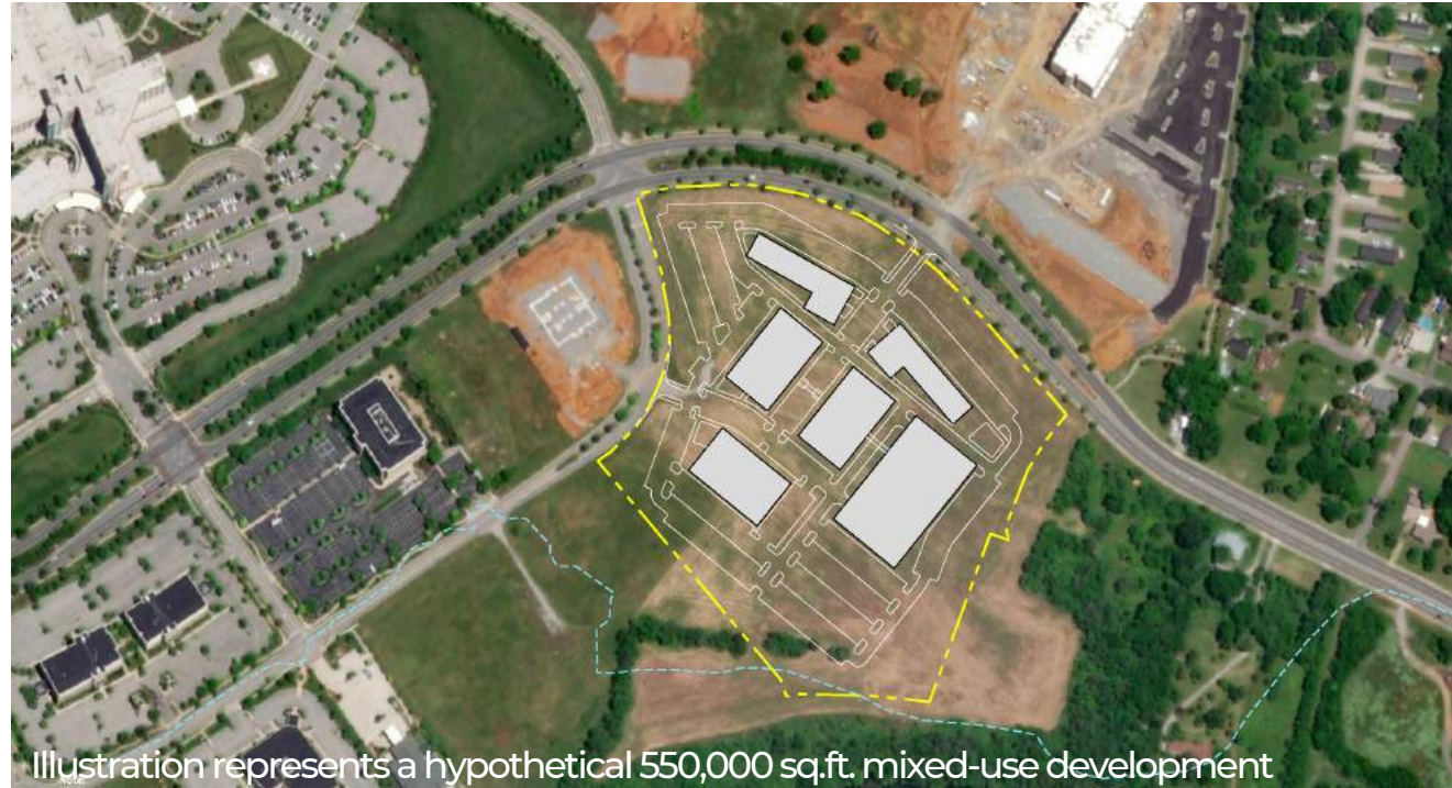
Illustration represents a hypothetical 550,000 sq.ft. mixed-use development